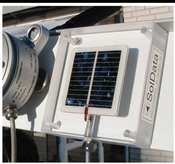
Figure 1: The SolData 80spc pyranometer is supplied with a 3 meter long cable and a weather-proof IP54 connection to the instrument.