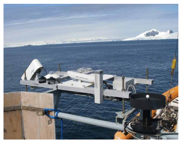
Figure 2: Two SolData pyranometers performed measurements during the Danish Galathea 3 Expedition 2006-07 here shown near the Palmer Peninsula.

SolData pyranometers are used to measure solar irradiance from as far north at Thule in northern Greenland to the Palmer peninsula in Antarctica.