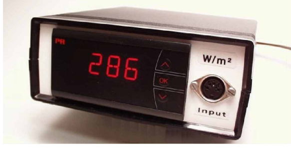
Figure 5: Continuous display of irradiance in W/m<sup>2</sup> can be achieved using a SolData DM-PYR. Options include relays and a 0-20mA current loop output signal.