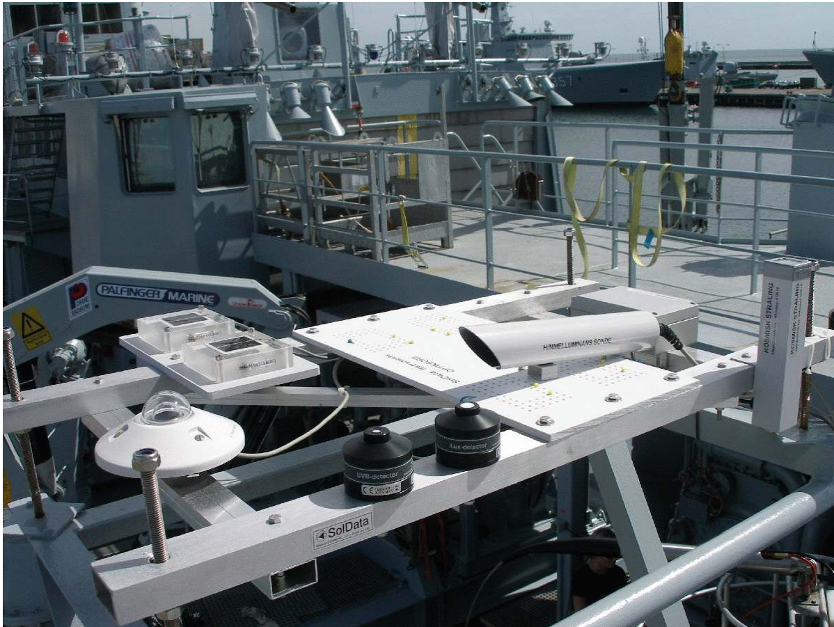
Figure 2: The optics table was an aluminum frame firmly fastened to the aft port side of the vessel near the rail. The sky luminance sensor (at right) points towards the horizon with an elevation angle of about 10 degrees. The two SolData photovoltaic pyranometers are visible at the left rear behind the Kipp-Zonen CM 11.

Sunday. The raw data were then transferred in a block to an Excel spreadsheet for calibration, unit conversions, graphics and other data analysis. This database was updated weekly throughout the duration of the voyage. It is currently available to all at the internet address: www.soldata.dk