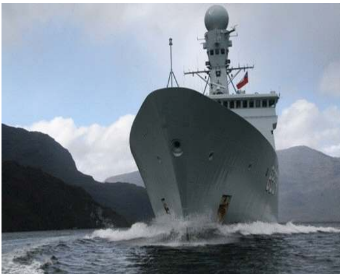
Figure 1: The The Royal Danish Navy vessel Vædderen served as instrument platform for the SolData optics table during the 100.000 kilometer, eight month round the world voyage of exploration and scientific research. It was conducted under the auspices of the Danish Galathea 3 Expedition. Previous Galathea expeditions sailed from Denmark in 1845 and 1950.

Our data was recorded in the same fashion as is standard practice for the Danish Met Office: 10 minute averages are recorded every 10 minutes. In the case of the GM counter the total number of counts during each 10 minute interval was recorded. All data records were date and time stamped with the UTC time. An e-mail was sent by a technician on board weekly with data from Monday through